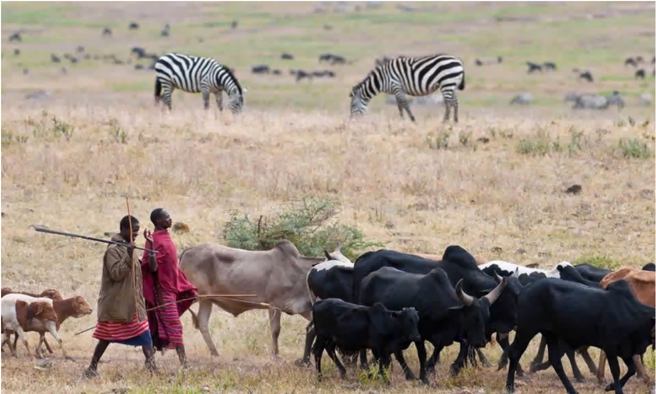
Maasai pastoralists looking after livestock and living with wildlife, Ngorongoro, Tanzania.