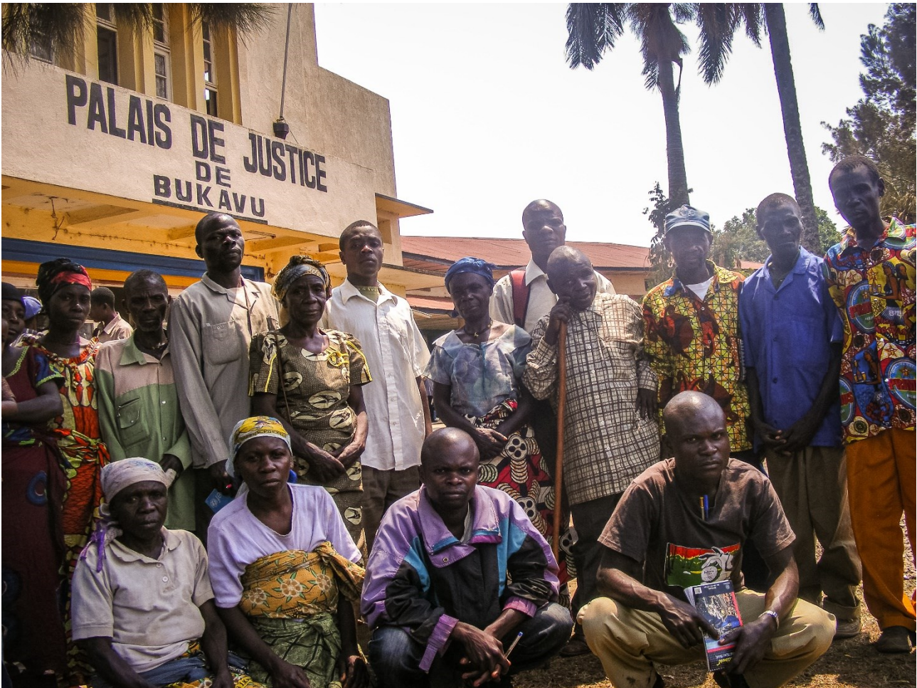
Delegation of Batwa claimants for the second instance hearing at the Bukavu courthouse after the Kavumu first instance judgment.

Local communities, including peasants, pastoralists, fishers and forestry people (as defined by the UN Declaration on the Rights of Peasants, UNDROP ) 13 play an equally important role. They protect biodiversity through agroecology, agroforestry, pastoralism and other sustainable land-use management methods (e.g. cultivating various crop types, breeding adapted livestock and managing healthy and resilient landscapes). 14 Pastoralists, for example, actively contribute to biodiversity conservation in rangelands, provided they are not hindered in their mobility. 15 Grazing animals eat dead grass and other biomass at the dry season's end, paving the way for new growth in the rains and preventing the spread of unpalatable grasses and shrubs. Removing people and livestock for exclusionary conservation or "rewilding" measures, in turn, can trigger ecologically damaging wildfires, invasion by alien plant species and reduced carbon storage potential. 16