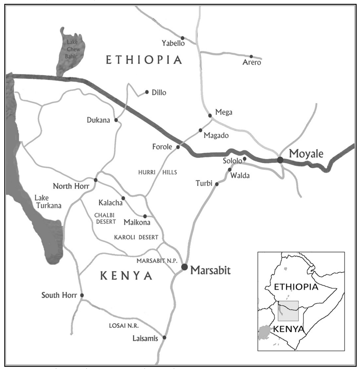
Map showing northern Kenya and southern Ethiopia<sup>1</sup>

Sources: Pastoralist Consultants International & Pat Kirby, 2009.