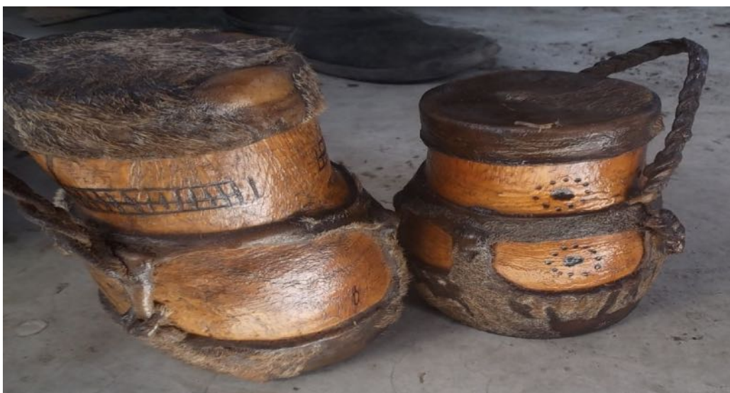
Figure 3: Traditional wooden-leather packaging common for preserving deep-fried meats by pastoralists