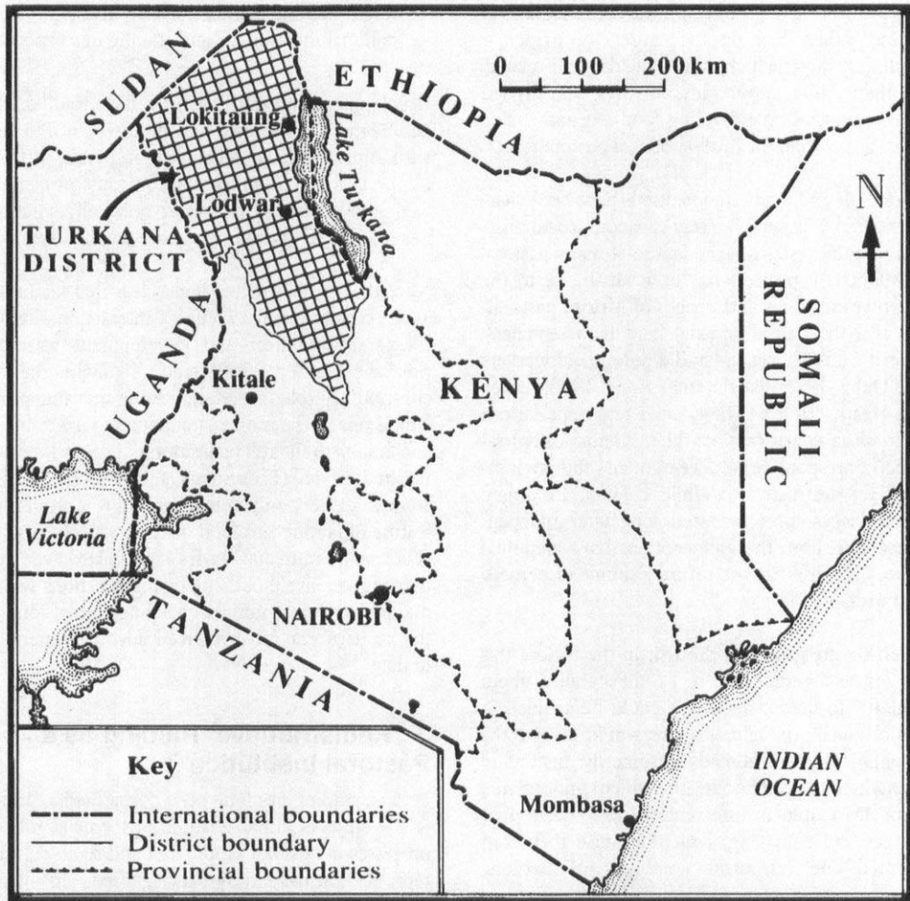
Figure 1 Location of Turkana District within Kenya and the Horn of Africa

Note Map reproduced from A Development Dialogue: Rainwater Harvesting in Turkana , by kind permission of Intermediate Technology Publications.