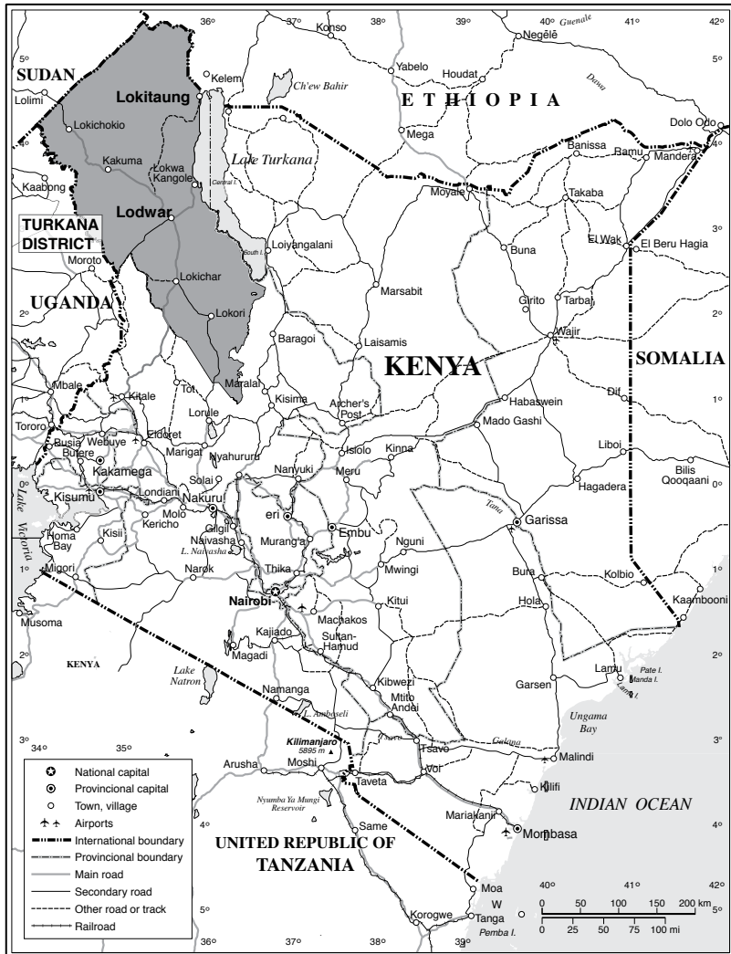
Figure 1: Map of Turkana district (Cullis and Pacey 1992:186)